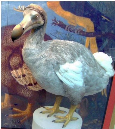
Dodo ( Raphus cucullatus )