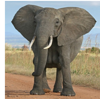
African elephant ( Loxodonta africana )