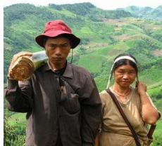
Human ( Homo sapiens )