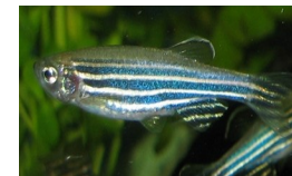
Zebra fish ( Danio rerio )