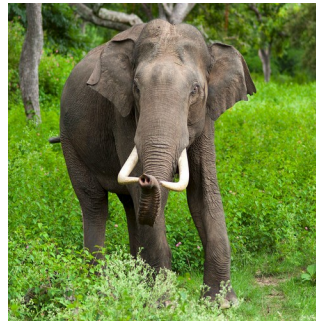
Asian elephant ( Elephas maximus )