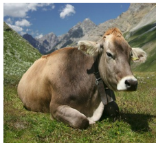
Cattle ( Bos taurus )