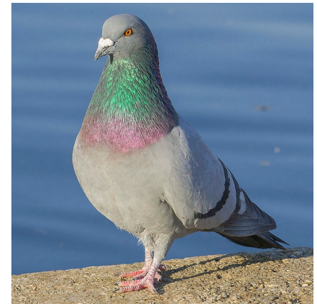
Pigeon ( Columba livia )