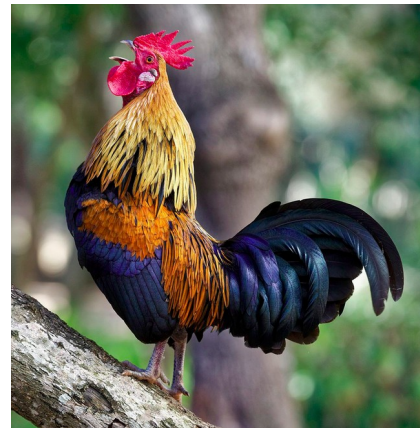
Chicken (rooster) ( Gallus gallus )