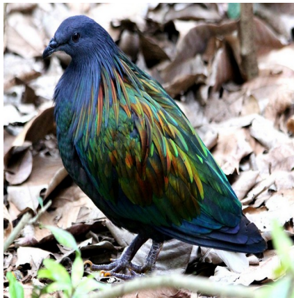
Nicobar pigeon ( Caloenas nicobarica )