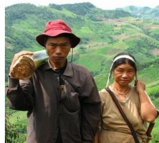
Human ( Homo sapiens )