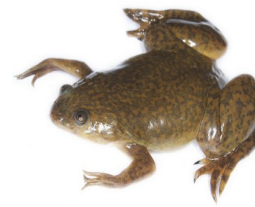
Frog ( Xenopus laevis )