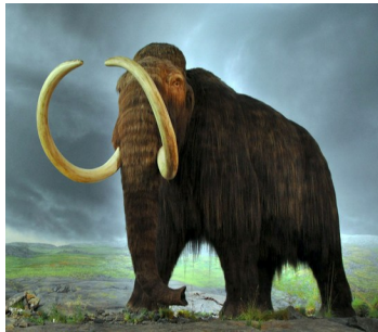
Woolly mammoth ( Mammuthus primigenius )